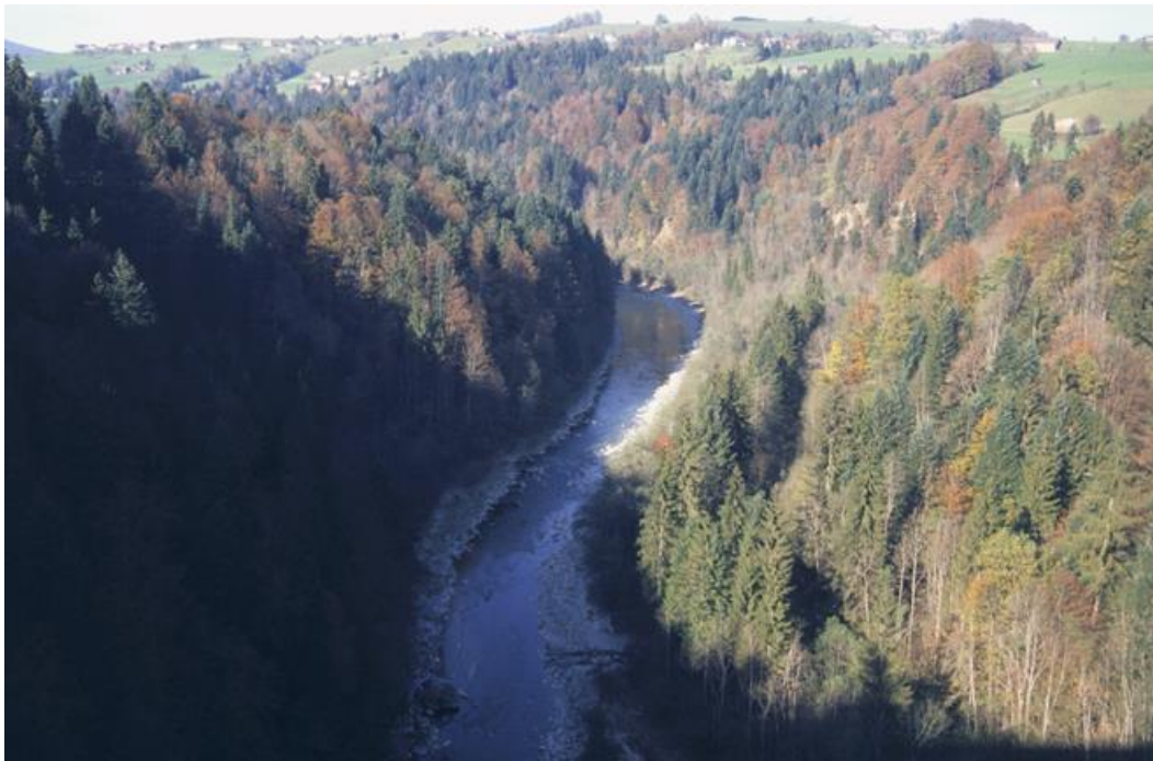
Figure: The increase of base flow and the peak diversion into a compensation basin mitigated the effects of hydropeaking and water abstraction due to hydropower production at the Bregenzer Ach in Austria (BOKU,IHG)

The restitution of the peak flow directly into a lake, a compensation reservoir or into a parallel tailwater channel, and the controlled restitution of turbine water into the river in order to improve flow regime and re-establish natural-like condition are the most common measures.