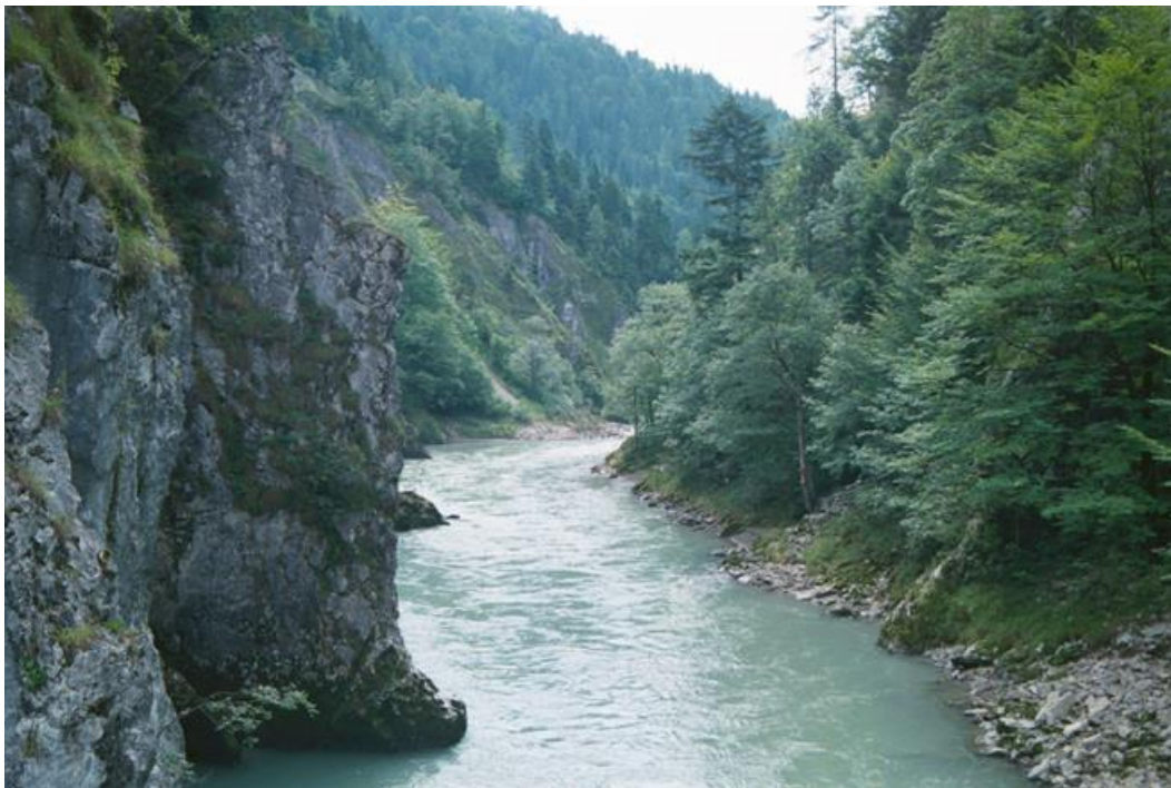
Photo: Medium-large, sinuous-straight highland river with bedrock-coarse mixed sediments in Austria (BOKU, IHG).