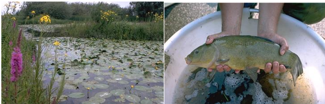
Figure: Restoration measure to improve floodplains: Floodplain lakes which inundate a limited number of days per year harbour limnophilic fish species such as tench