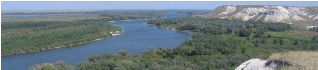
Figure: The River Don (Russia) still has significant near-natural stretches along its course.

Large rivers have upstream catchments > 10,000 km 2 and the very large even > 100,000 km 2 (e.g. Danube, Rhine, Elbe, Vistula and several Russian rivers). Due to their size the flow regime is more stable and the role of vegetation is less than in small and medium-sized rivers. Most very large rivers are situated in the lowland i.e. below 200 m ASL though large rivers are also found in the midland regions (e.g. the confluence of the River Inn (25,700 km 2 ) with the Danube is at 291 m ASL).