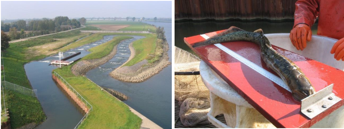
Figure: Restoration measures to improve longitudinal connectivity: the fish pass near Hagestein in the Neder-Rijn. Monitoring showed that among 38 fish species numerous diadromous lampreys migrated through this fish pass)